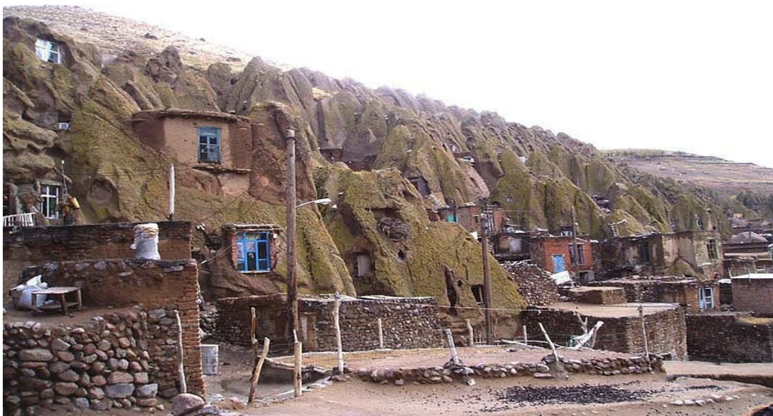
Figure 2. Kandovan village