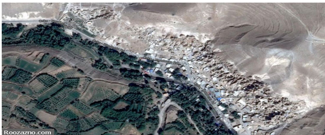
Figure 1. Satellite Image of Kandovan